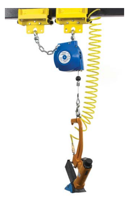
EB Model, Trolley Nail-Gun Application