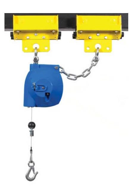
EB Model, Rear View, Trolley Application