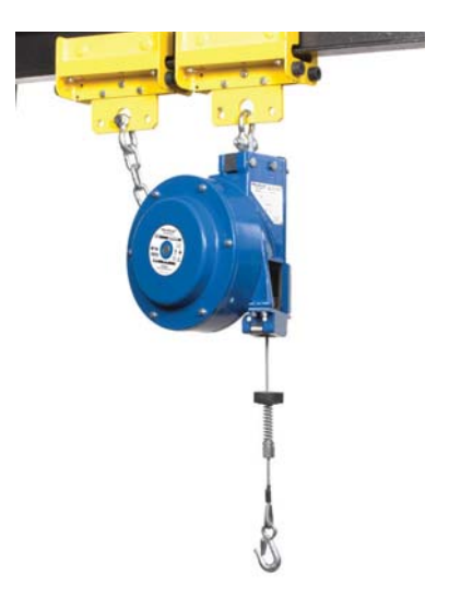
KA Model Balancer and Trolley Application